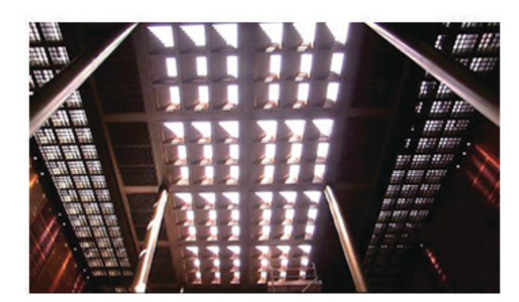
2. Roof system start to interact. The panels move parallel to the building's surface, allowing its layers to be completely hidden when retracted.