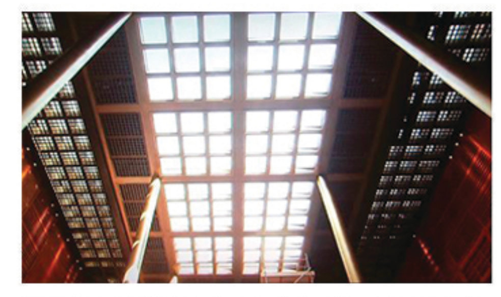
3.Roof system fully open, allowing sunlight to penetrate brightening interior spaces. Each unit is driven by a servo motor with custom array control.